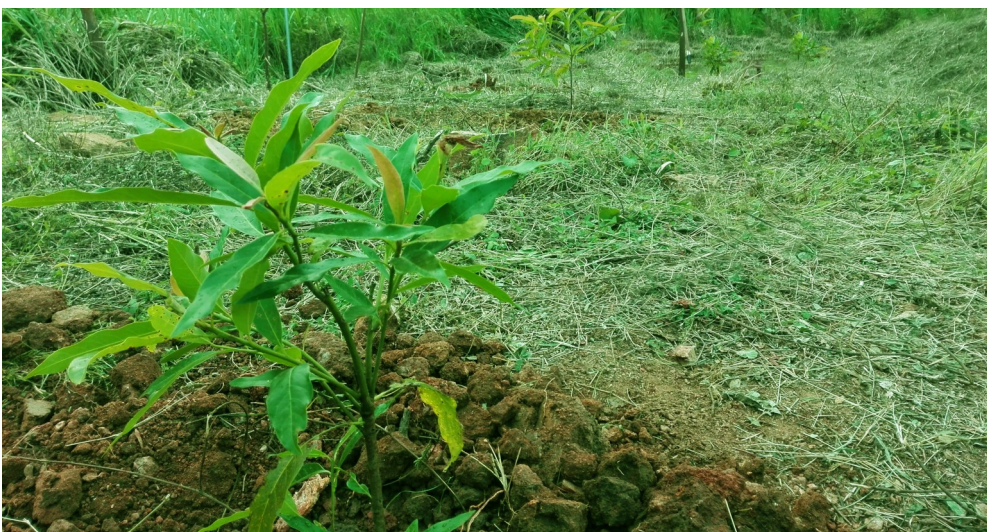
Planted seedlings at Moragahakanda Land

- Secretary, The Ministry of Mahaweli Development and Environment -