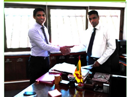
Signing MoU between FD and SLCF

- Conservator General of Forest, Forest Department